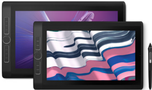
Featured products: Wacom MobileStudio Pro 15.6" and 13.3" Featured artists: Future Deluxe & Santtu Mustonen

Whatever, wherever ... you can create anything with Wacom MobileStudio Pro. With its awesome display, a precise and powerful pen plus enhanced computing power, you can enjoy true independence. Not only that, its complete studio of creative tools, exceptional graphics and long battery life means nothing can compromise your creative flow.